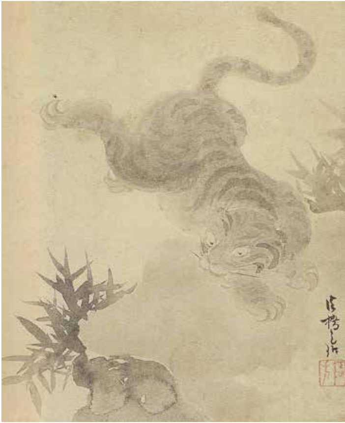
Ogata Kōrin, 'Tiger and Bamboo'

they excelled in depicting birds, trees and flowers. The Japanese, as befits an island country, have an affinity with the sea and the Rinpa painters were particularly adept at depicting waves. Their stylized wave designs had a particular and understandable appeal to the makers of Japanese kimono who were based in Kyoto. Many of these designs inspired western artists and seem strikingly modern.