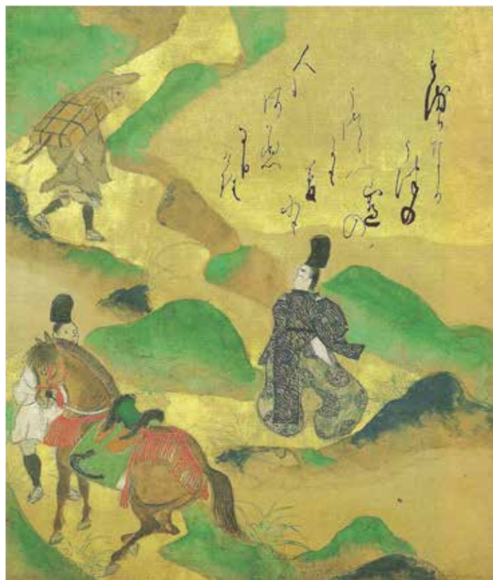
Tawaraya Sōtatsu, scene from Tales of Ise

Carpenter describes and illustrates the various subjects, which Rinpa painters chose. In addition to illustrating traditional Japanese tales, they portrayed poets and sages, but as became Japanese painters, in whose tradition the depiction of nature was a key element,