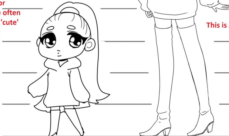
This is Ariana Grande

http://chitangarden.wix.com/chiekutsuwada Twitter: @chitanchitan