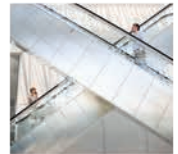
Lifts & Escalators