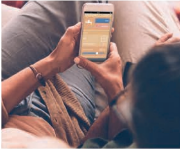
Living Environmental Systems

Find out more at emea.mitsubishielectric.com