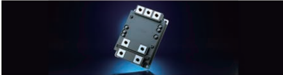
Semiconductors & Devices