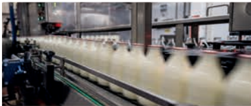
Factory Automation Systems