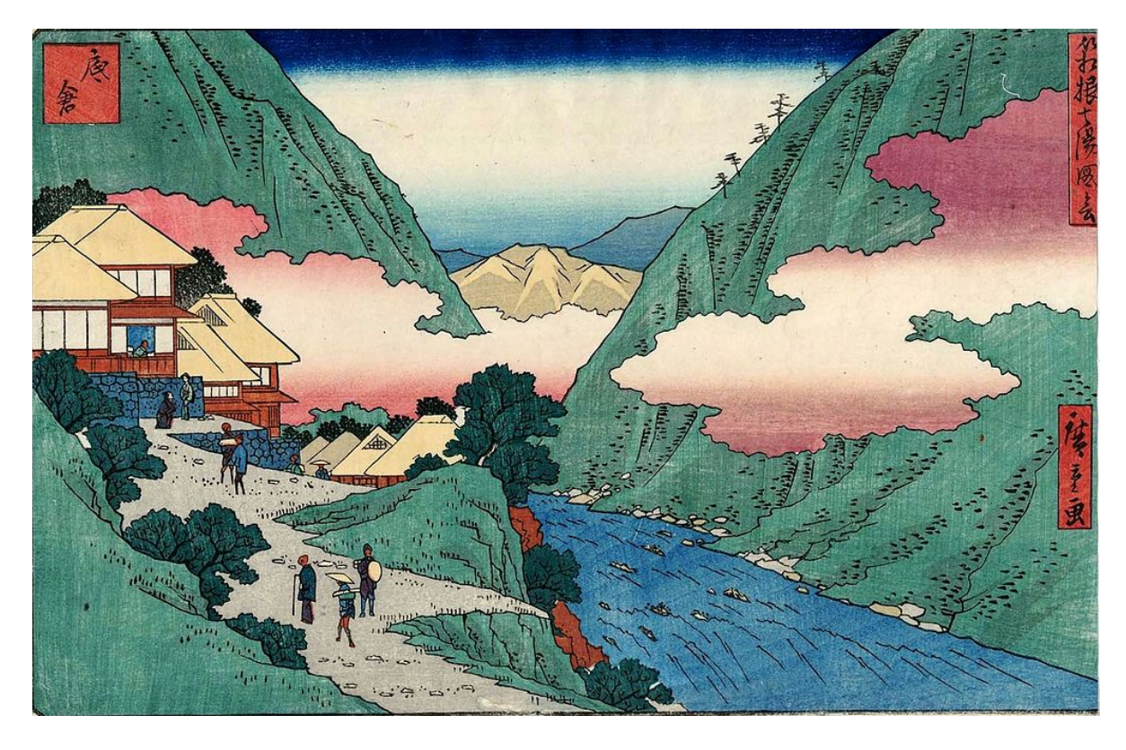
Seven Hot Springs of Hakone – by Hiroshige