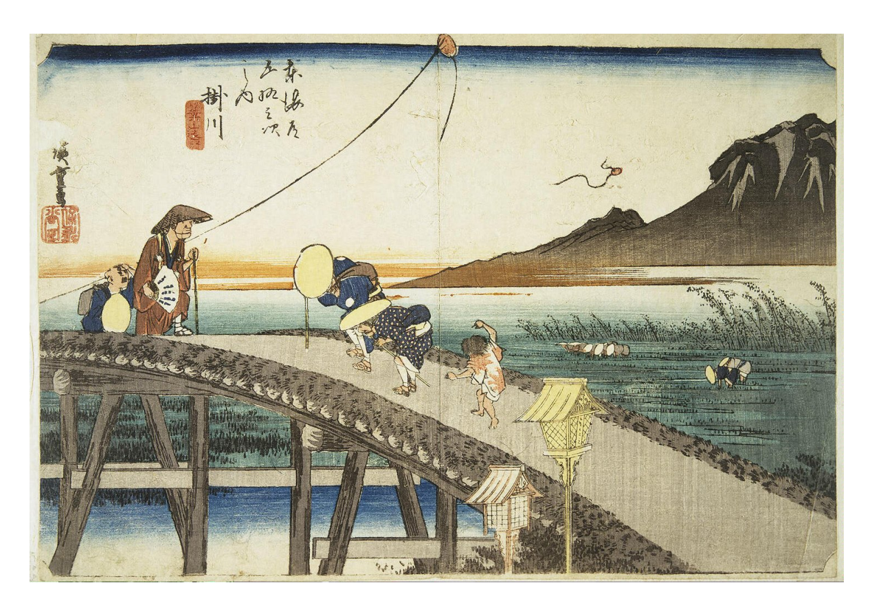
Kawaga: View of Mount Akiba by Hiroshige